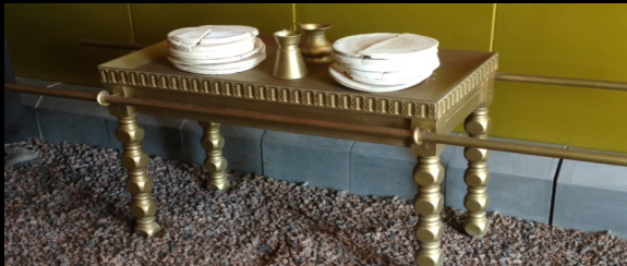
Watermark Community Church - Spring 2017 - Blake Holmes 68