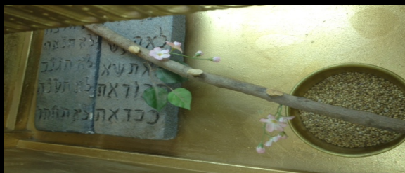
Watermark Community Church - Spring 2017 - Blake Holmes