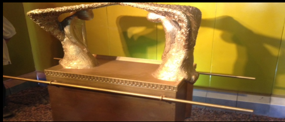
Watermark Community Church - Spring 2017 - Blake Holmes