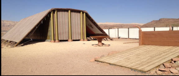
Watermark Community Church - Spring 2017 - Blake Holmes 67