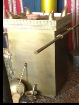
Watermark Community Church - Spring 2017 - Blake Holmes