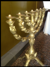
Watermark Community Church - Spring 2017 - Blake Holmes 69