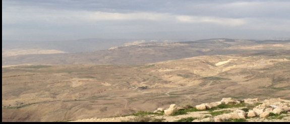
Watermark Community Church - Spring 2017 - Blake Holmes