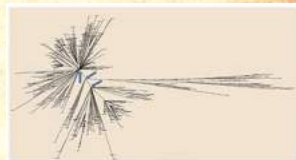
The human mitochondrial DNA tree shows three central nodes, marked by blue arrows. These are the ancestor of exposed mtDNA sequence differences between the lines of Shem, Ham, and Japheth. The longest branches represent the highest number of mtDNA differences between people groups, and these lineages match Bible-based predictions. Image adapted from supplemental Figure 1 from Jaxson's paper. Used by permission of Answers in Genesis.